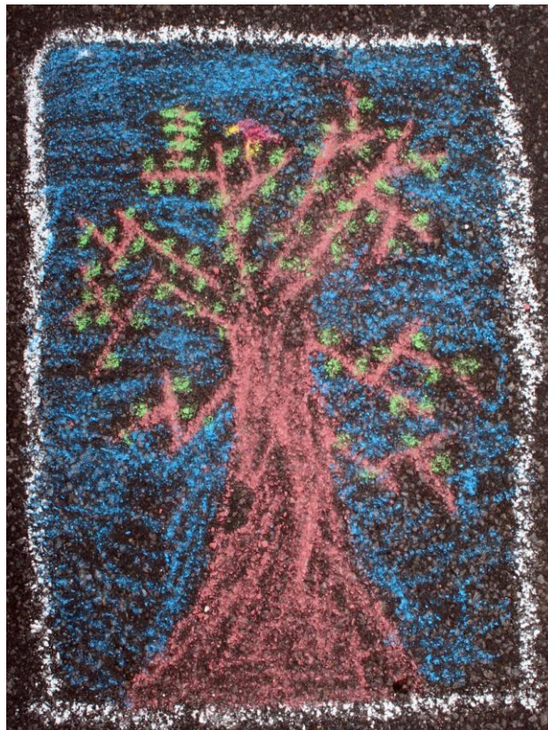
Designed by Maqsuda

This was a successful event in terms of bringing families from different backgrounds together for a fun yet educational activity. We did things a bit different this year and used the tree trail designed by Small World as an activity. People followed a route mapped out by the group to identify trees around the park. This worked a treat and not only did families get the opportunity to do something together; they were able to increase their knowledge of the many different trees in the park. All participants were given eggs after completing the trail and many people asked to do more which indicated they had really enjoyed the experience.